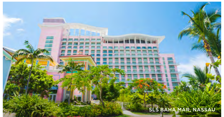
SLS BAHAMAR, NASSAU

As we prepare to welcome you back on board, our new Crystal Clean+ health and safety measures, including a vaccine requirement, build on Crystal's already stringent protocols to help safeguard the well-being of our guests and crew. Visit: crystalcruises.com/crystal-clean for details.