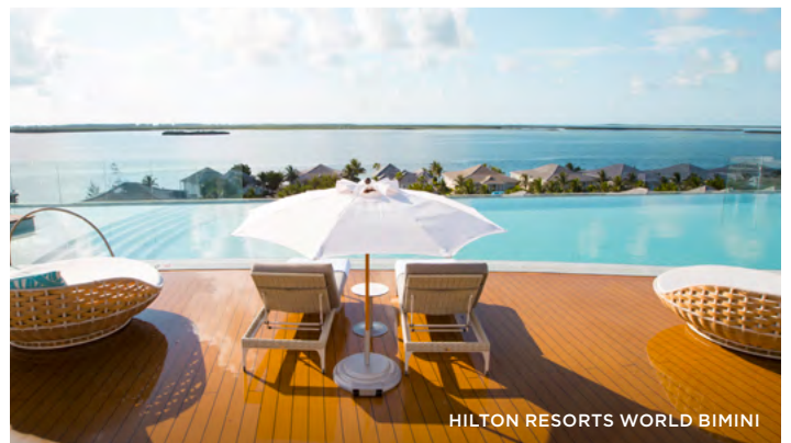
HILTON RESORTS WORLD BIMINI